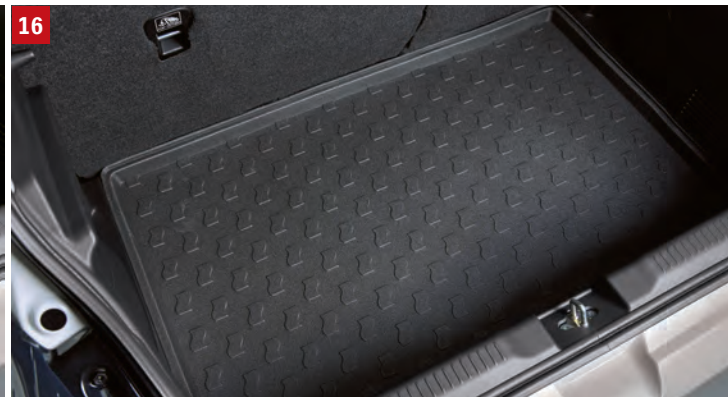
16 | CARGO TRAY 1 Waterproof with raised edges. Part No. 990E0-53R15-000