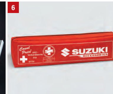
6 | FIRST AID KIT Including warning triangle and a safety vest, complies with DIN 13164. Part No. 990E0-61M79-000