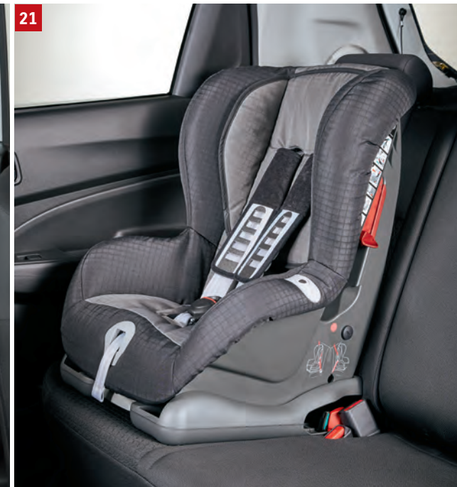
21 | CHILD SEAT "DUO PLUS" Child seat of group 1 for kids of 9 to 18 kg of weight or approx. 9 months to 4 years of age. This seat is tested and approved to the current Child Seat Safety Standard ECE R 44/04. Installation in the car by the ISOFIX brackets, the seat features optimum side impact protection, unique Forward Tilt Control, singlehanded adjustment to change from the upright position to the reclined and sleeping positions. 5-point harness system with one-pull adjustment, shoulder pads reduce the load in the neck/head area. The comfortable fabric cover is removable for washing. The seat can also be fitted in cars without the ISOFIX system by using the vehicle's 3-point seat belt. Part No. 990E0-59J56-000