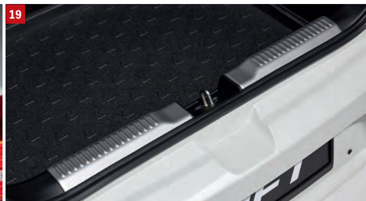
19 | INNER LOADING EDGE PROTECTION Aluminium brushed design, made of thermoplastic, protects your inner loading edge from scratches when loading and unloading. Part No. 990E0-53R52-000