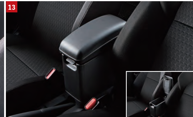
13 | CONSOLE BOX ARMREST With large storage compartment. Part No. 9914G-53R11-000