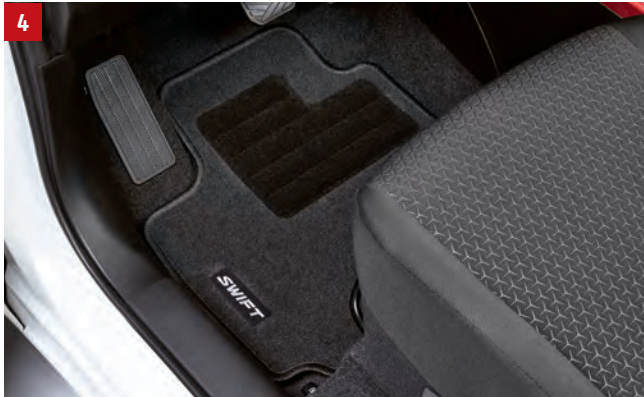
4 | FLOOR MAT SET “ECO” 1 Anthracite needle felt carpets with silver stitched logo and black binding, four-piece set, for M/T and A/T. Part No. 75901-52RE1-000 LHD Part No. 75901-52RD1-000 RHD (no image)