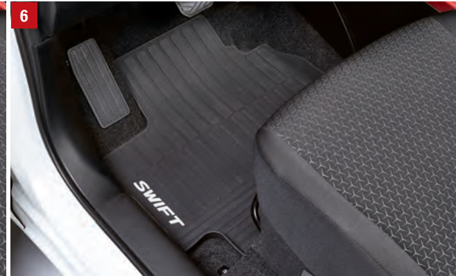
6 | RUBBER FLOOR MAT SET 1 Raised edge to help keeping the footwell clean, four-piece set, for M/T and A/T. Part No. 75901-52R11-000 LHD Part No. 75901-52R01-000 RHD (no image)