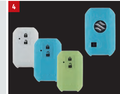
4 | "GLOW IN THE DARK" SILICON KEY COVER Glows in the dark by absorbed light energy and protects your car key from scratches. Available in following colours: WHITE Part No. 99000-79N12-377 BLUE Part No. 99000-79N12-378 LIME GREEN Part No. 99000-79N12-379