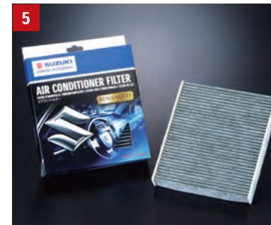
5 | A/C DEODORANT FILTER Filters dust, pollen, sand, mites, unpleasant odours from outside and inside the car and other air impurities including the PM2.5 capturing effect which keeps the air in a cabin cleaner than the air filtered by standard A/C filter. Part No. 99250-53R01-000