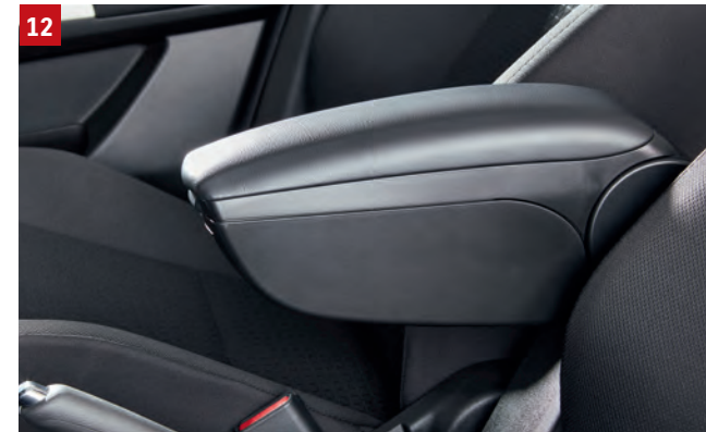
12 | CENTER ARMREST For more comfort, with storage department, adjustable in height and length, black. Part No. 990E0-53R35-000