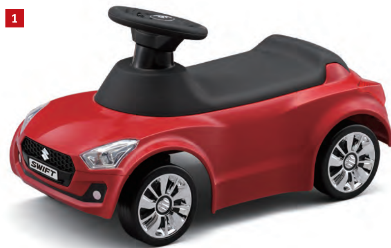
1 | KID'S CAR, SWIFT For 18 months - 36 months Children Allowable Weight: 7kg - 23kg H346mm × W302mm × L628mm Part No. 99000-79NN0-000