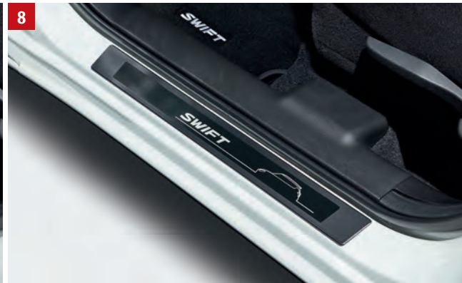
8 | SIDE SILL SCUFF Black including inlay printed Swift logo, four-piece set. Part No. 990E0-53R60-001