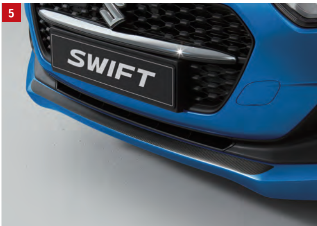
5 | LIP DECAL FRONT BUMPER One-piece, carbon design. Part No. 990E0-53R97-000