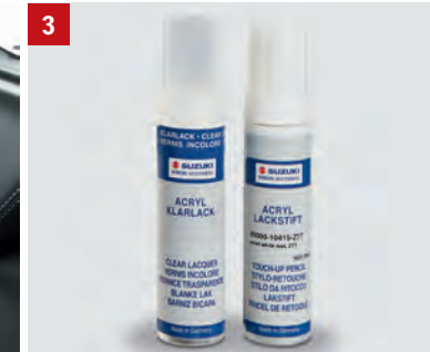
3 | TOUCH-UP PAINT Available in following colours: Burning Red Pearl Metallic (ZWP) Part No. 99000-10415-ZWP Speedy Blue Metallic (ZWG) Part No. 99000-10415-ZWG Pure White Pearl (ZVR) Part No. 99000-10415-ZVR Super Black Pearl (ZMV) Part No. 99000-10415-ZMV Premium Silver Metallic (ZNC) Part No. 99000-10415-ZNC Mineral Gray Metallic (ZMW) Part No. 99000-10415-ZMW Fervent Red (ZNB) Part No. 99000-10315-ZNB Flame Orange Pearl Metallic (ZWD) Part No. 99000-10415-ZWD Rush Yellow Metallic (ZYK) Part No. 9925D-B0100-ZYK