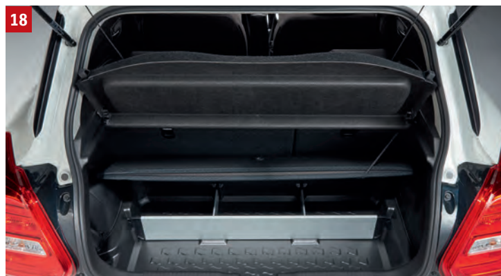
18 | CARGO ORGANIZER 1 Tray including variable aluminium dividers and top cover. Part No. 990E0-53R21-000