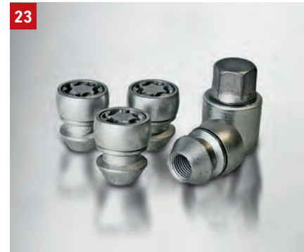
23 | WHEEL LOCKS “SICUSTAR” Four-piece set, with Thatcham approval.