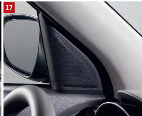
17 | TWEETER SET Package includes : • Tweeter • Harness set • Tweeter covers (L/R) Part No. 990E0-53R18-000