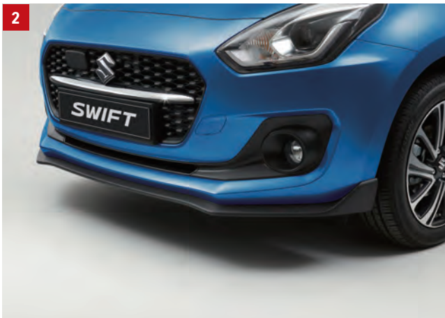
2 | FRONT UNDER SPOILER Diffuser style, carbon design. Part No. 990E0-53R44-000