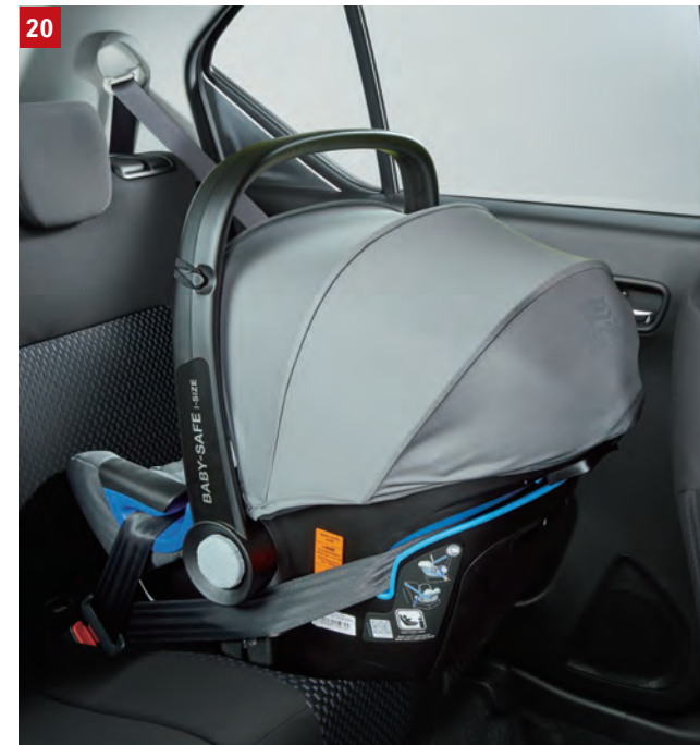
20 | CHILD SEAT "BABY-SAFE I-SIZE" Baby-Safe i-Size is an infant carrier that conforms to the new car seat regulation ECE R 129. The seat provides safety and comfort for newborns up to 15 months, adjusting and protecting your child as they develop and grow to 83 cm in height. Part No. 88501-77R00-000