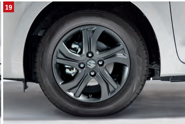
19 | ALLOY WHEEL “COSMIC” Mistral anthracite matte painted, 5Jx15” alloy wheel for 175/65R15 tires, centre cap with Suzuki logo. ECE R124 and JWL approval. Part No. 43210-52RU0-000