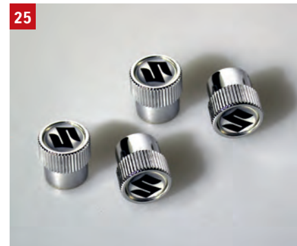
25 | VALVE CAP SET WITH S-LOGO Silver, four-piece set. Part No. 990E0-19069-SET