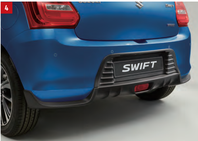
4 | REAR UNDER SPOILER Diffuser style, carbon design. Part No. 990E0-53R47-000