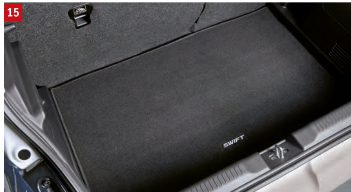
15 | CARGO MAT "ECO" Anthracite needle felt carpet with silver stitched logo and black binding. Part No. 990E0-53R40-000