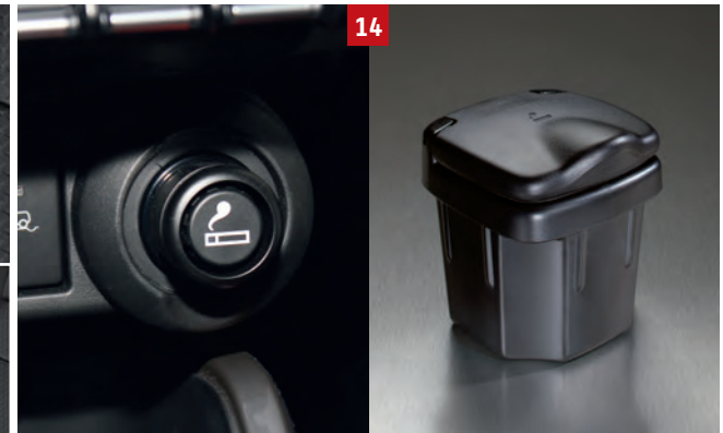
14 | SMOKER'S KIT Contains Cigarette Lighter (p/n 39400-59J00-000) and ashtray (p/n 89810-86G10-5PK). Part No. 990E0-68P00-SMK