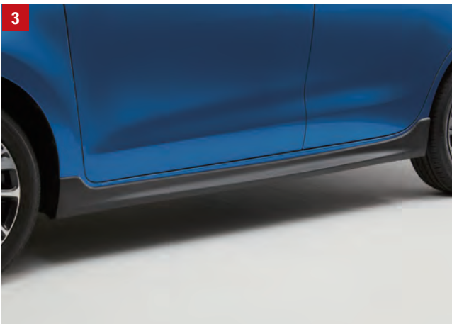
3 | SIDE UNDER SPOILER Carbon design, for right and left hand side. Part No. 99112-53R01-000