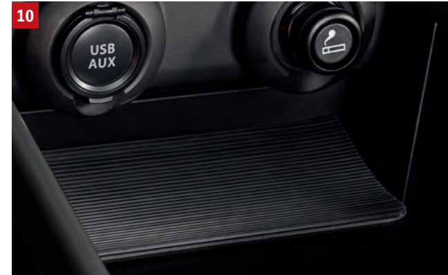
10 | ANTI SLIP INLAY For the centre console to prevent content rattling or moving around. Part No. 990E0-53R20-000