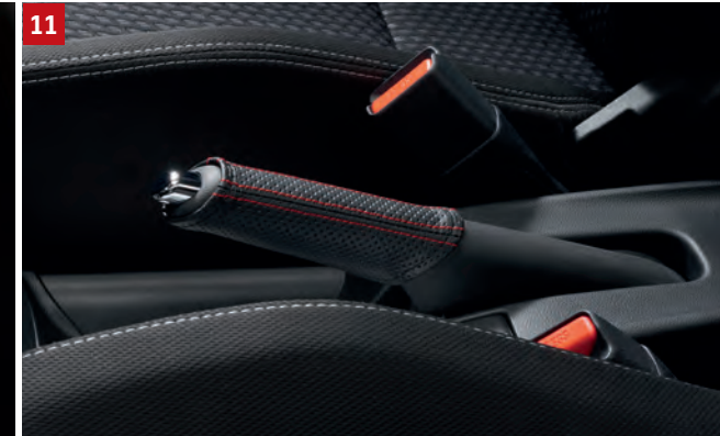
11 | PARKING BRAKE HANDLE COVER Leather, with red stitching. Part No. 990E0-53R17-000