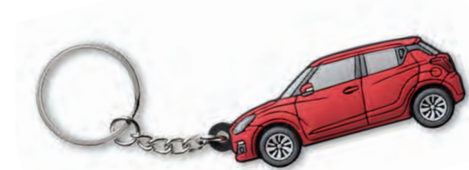
2 | RUBBER KEY HOLDER, SWIFT H25mm × W113mm Part No. 99000-990M1-K04