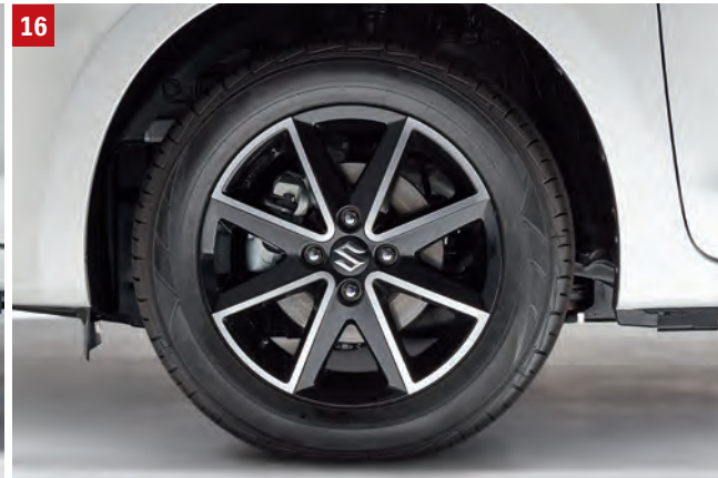
16 | ALLOY WHEEL “SAMBA” Black polished, 5Jx15” alloy wheel for 175/65R15 tires, centre cap with Suzuki logo. ECE R124 and JWL approval. Part No. 43210-60PS0-OSP