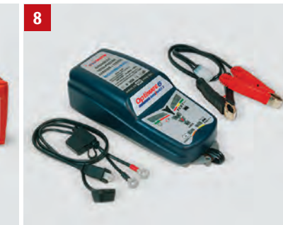
8 | BATTERY CHARGER Maintainer and tester for 12V batteries, optimizes battery power and life. Part No. 990E0-OPTIM-CAR