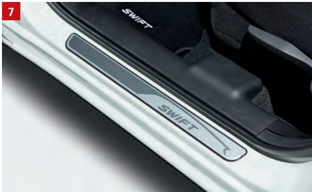
7 | SIDE SILL SCUFF Anodized aluminium satin surface, four-piece set, with polished Swift logo. Part No. 990E0-53R60-000