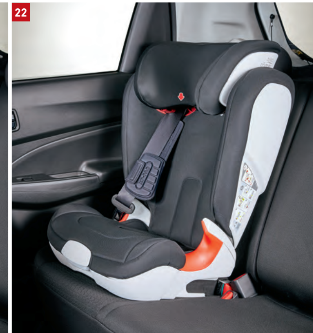
22 | CHILD SEAT "KIDFIX XP" The KIDFIX XP is a new child seat of group 2 and 3 and offers safety reassurance for parents and comfort for the older child from approximately 15 to 36 kg. This high back booster seat's innovative XP-PAD gives advanced frontal protection. This seat is tested and approved to the current Child Seat Safety Standard ECE R 44/04. Installation in the car by the ISOFIX brackets, the seat features optimum side impact protection. Its SecureGuard (patent pending) ensures optimal lap belt positioning. And its deep softly padded side wings offer cocooning safety for growing heads and neck from 4 to 12 years. Part No. 990E0-59J25-002