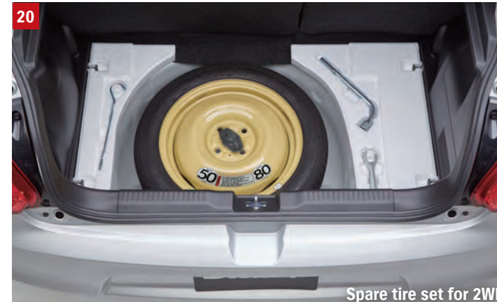
20 | SPARA TIRE KIT for 2WD 1 Includes spare tire kit, fixation kit , jack and jack bracket kit. Part No. 990E0-STSW2-001