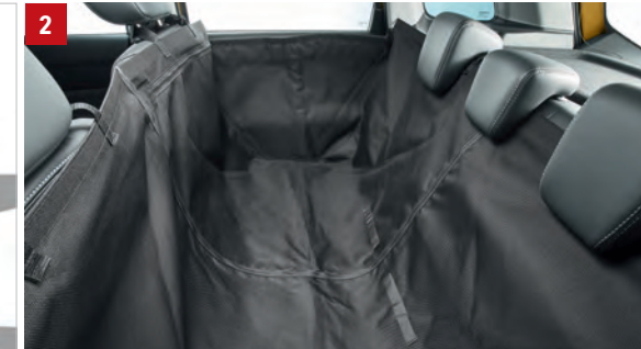
2 | REAR SEAT PROTECTIVE COVER For the rear seat upholstery. Part No. 990E0-79J44-000