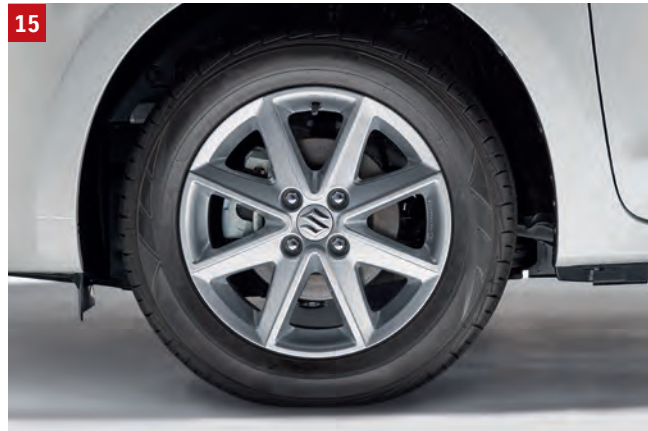
15 | ALLOY WHEEL “SAMBA” Silver painted, 5Jx15” alloy wheel for 175/65R15 tires, centre cap with Suzuki logo. ECE R124 and JWL approval. Part No. 43210-60PU0-OKS