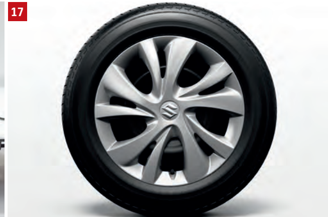
17 | 15-INCH WHEEL COVER Silver, for 15” steel wheel, one piece. Part No. 43250-52R00-ZH1