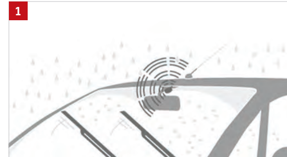
1 | RAIN SENSOR Automatically controls the wind screen wipers in its wiping speed depending on rain condition. Part No. 990E0-65J81-035