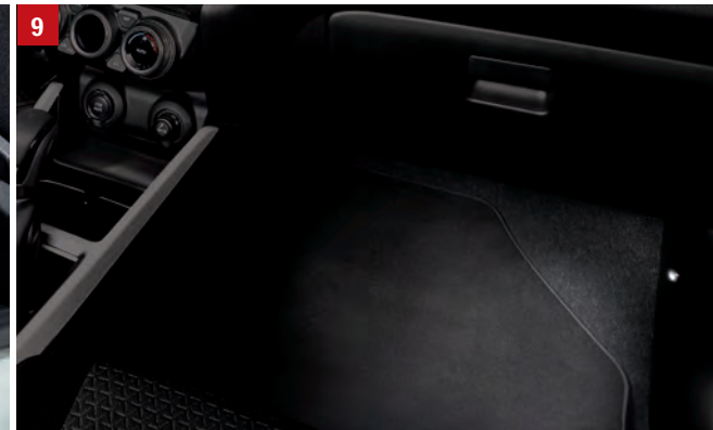
9 | FLOOR ILLUMINATION Optical white LED illumination, set for front and rear footwells, left and right side. Part No. 99213-53R01-000