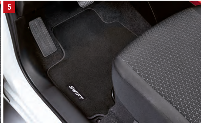
5 | FLOOR MAT SET “DLX” 1 Anthracite velour carpets with silver stitched logo and Nubuk binding, four-piece set, for M/T and A/T. Part No. 75901-52RG1-000 LHD Part No. 75901-52RF1-000 RHD (no image)